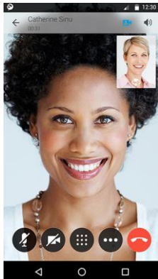
Figure 2. Cisco Jabber for Android (on Android Tablet)